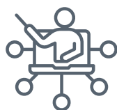
Virtual Learning Communities

We offer a wide range of professional development opportunities to support early childhood professionals in meeting licensing requirements and enhancing their skills. Through virtual and in-person trainings—including multi-part series, conferences, summits, and special events—we provide flexible options to meet the needs and interests of providers across the state. Our monthly Virtual Learning Communities (VLCs), designed for Directors, Teachers, and other professionals, offer meaningful discussion, resource sharing, and networking opportunities. All offerings align with the NH Early Childhood Professional Development System and promote growth, connection, and quality in early childhood education.