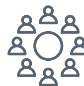
On-Site Mini Conferences